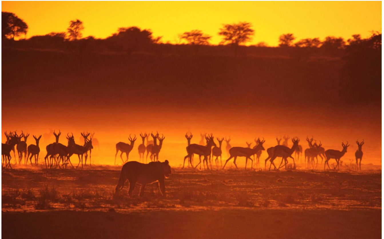
Figure 4 - Welcome to Tanzania