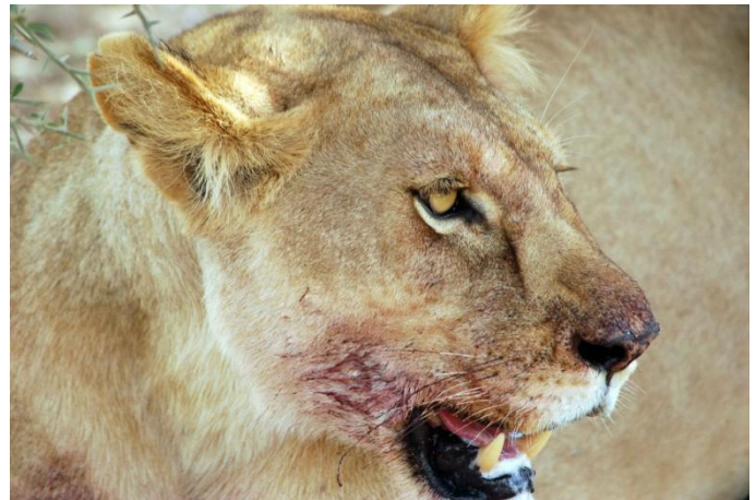
Figure 4 – Lioness in Selous

Program: We leave from Dar Es Salaam domestic airport by Coastal flight to Selous Game Reserve . We land inside the park. Our guide is waiting for us and we have a game drive on the way to the tented camp or lodge. Lunch at the tented camp/lodge. In the afternoon we can choose our activity (game drive, walking safari or boat safari).