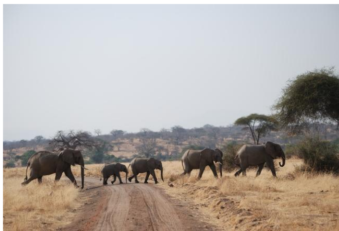
Figure 3 - Elephants in Ruaha

Elephants are found in some of the highest concentration in the country, travelling in matriarch-lead herds through ancient grazing lands and seasonal supplies of water. The Great