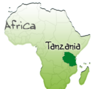
Figure 1 - Africa and Tanzania

When we talk about Tanzania Tourism we talk about the famous Mt. Kilimanjaro, Ngorongoro Crater, Serengeti, Great Migration, Rift Valley or the spice Island of Zanzibar.